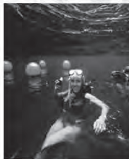
Geo-thermal crater for Scuba and swimming