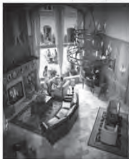
Cozy old world settings