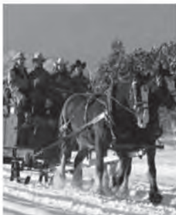
Winter sleigh rides