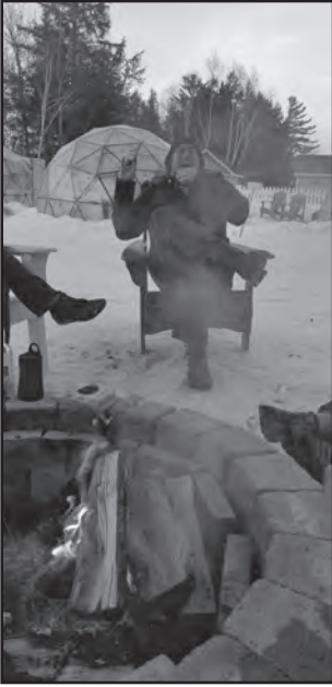
Phil Uhler